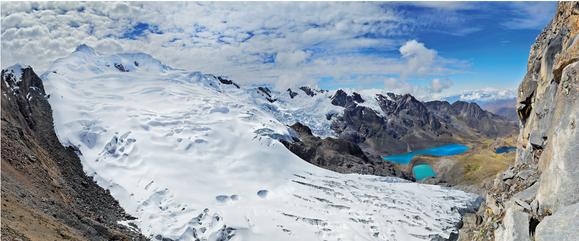
Figure 3 – The Cordillera Huaytapallana is part of Central Peru’s eastern cordillera.

PA. Put simply, the decree explicitly permits the use of renewable resources while restricting the exploitation of nonrenewable resources (Anonymous 2011, p. 446882–446883), a fact which is particularly important for the five agrarian communities adjacent to the PA (GRRNGMA 2014, p. 41–58). The designation, however, also brought potential for conflict in the Shullcas River watershed.