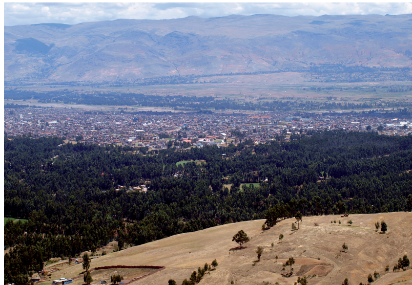
Figure 1 – The metropolitan area of Huancayo is located in the Mantaro Valley of Peru.

The geography of Peru, like the Andes in general (Córdova-Aguilar 2009; Borsdorf & Stadel 2015), is